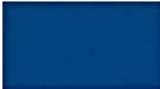
Blue Flame Metallic