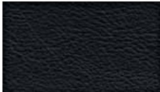
Leather - Charcoal Black Standard on Limited