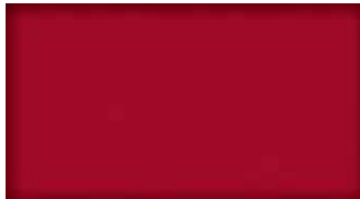
Sangria Red Metallic