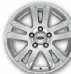
17" Painted Cast-Aluminum Included in XLT Appearance Package