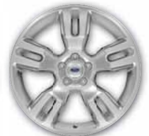
20" Polished-Aluminum Included in Adrenalin Package