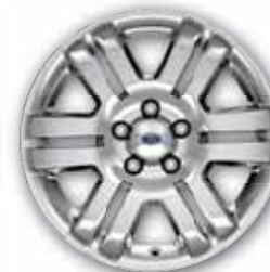
18" Chrome-Clad Aluminum Standard on Limited