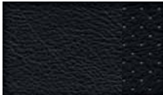
Leather - Charcoal Black with perforated inserts Standard on Limited with Adrenalin Package