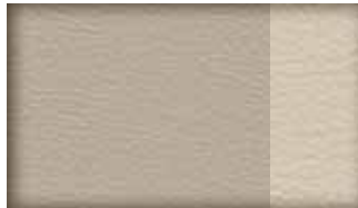
Leather - Camel with Sand inserts Standard on Limited