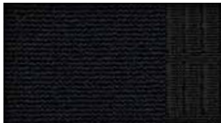
Cloth - Charcoal Black Standard on XLT