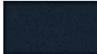
Black Pearl Slate Metallic