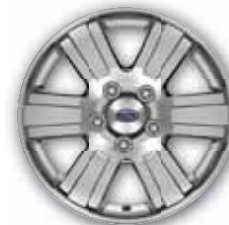
16" Painted Cast-Aluminum Standard on XLT