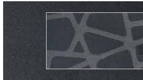
Cloth - Grey Standard