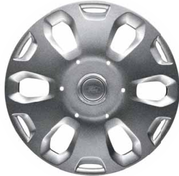
6-Spoke Wheel Cover Standard